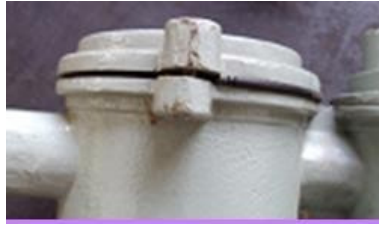
Figure 2. Improper fitting of Gasket in Exd apparatus