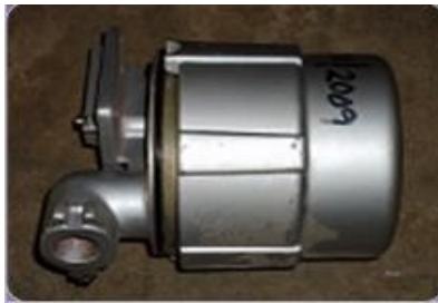
Figure 5. Improper thread engagement in Exd apparatus