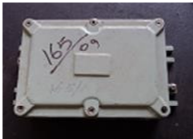
Figure 3. Missing of bolt in the Exd apparatus