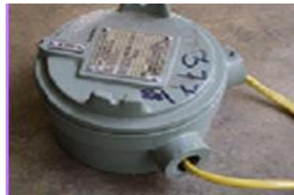
Figure 4. Passing cable without Exd cable gland