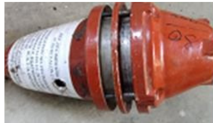
Figure 6. Improper fitting of Spigot joint